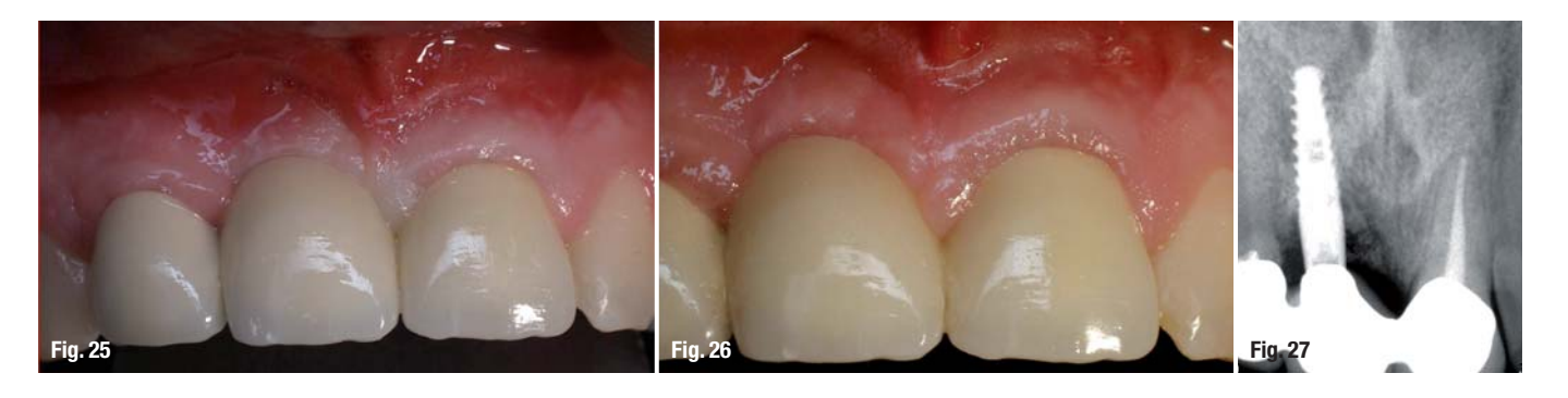
Fig. 25_Final result a year and five months post-op. Fig. 26_Three years and two months post-op. Fig. 27_X-ray image three years and two months post-op.

wavelength can be employed for the purpose of the decontamination of infected sites and it has been shown to be effective and safe.<sup>12,19,20</sup> In addition, post-operative effects such as pain and swelling are less pronounced. This laser has become an invaluable tool for many procedures by simplifying treatment and offering patients faster, less stressful oral therapy with enhanced outcomes.